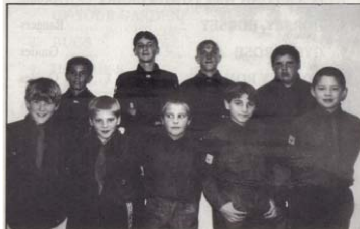
• Scouts — Scott Troop