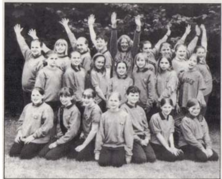
• 1st Cophorne Guides