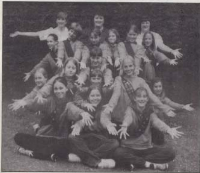
• 2nd Cophorne Guides