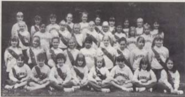
• 1st and 2nd Cophorne Brownies