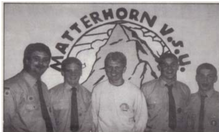
• Venture Scouts