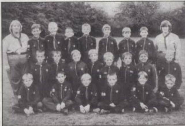
• Cubs - Ash Pack

We wish you all a very enjoyable Gang Show