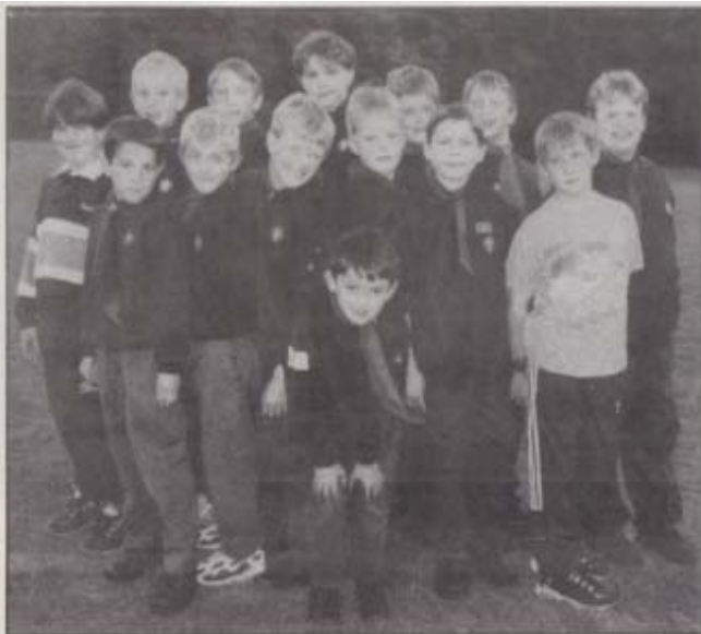
• Cubs – Oak Pack

activities, camps and training all year round. In recent months the Rangers have been canal barging, Ventures and Scouts camping in the Peak District, Guides on an activity week in Austria and Cubs and Brownies camping in Hertfordshire and Horsham. Beavers and Rainbows are not forgotten with their activity days and outings.