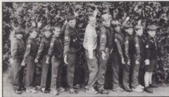
• Scouts — Mallory Troop