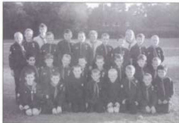
Ash Pack Cubs

Connells bringing the power of the network to Copthorne