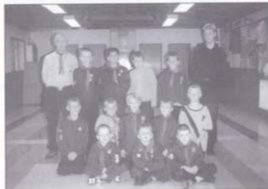
Oak Pack Cubs