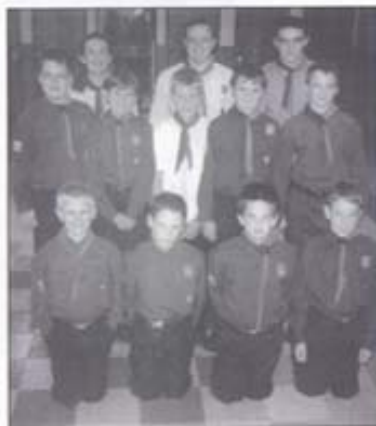
Mallory Troop Scouts