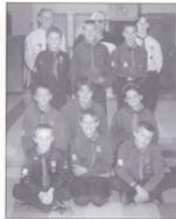
Scott Troop Scouts