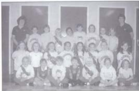
2nd Copthorne Brownies