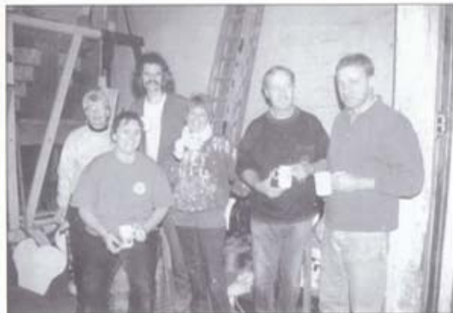
'Some of the prop's team, working hard?'