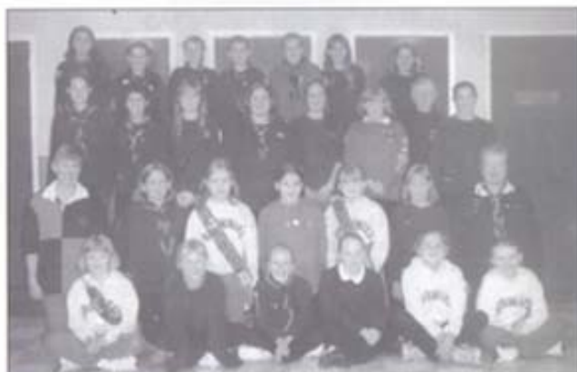
2nd Cophorne Guides