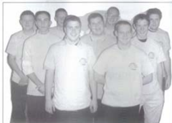
Matherhorn Venture Scout Unit