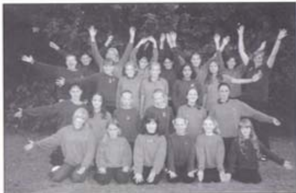
1st Copthorne Guides