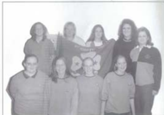
1st Copthorne Rangers